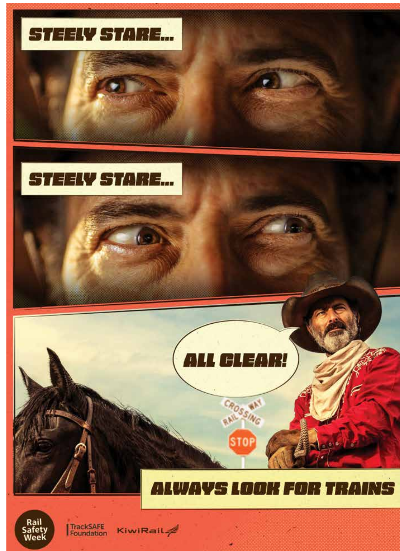
A new rail safety hero emerges for Rail Safety Week