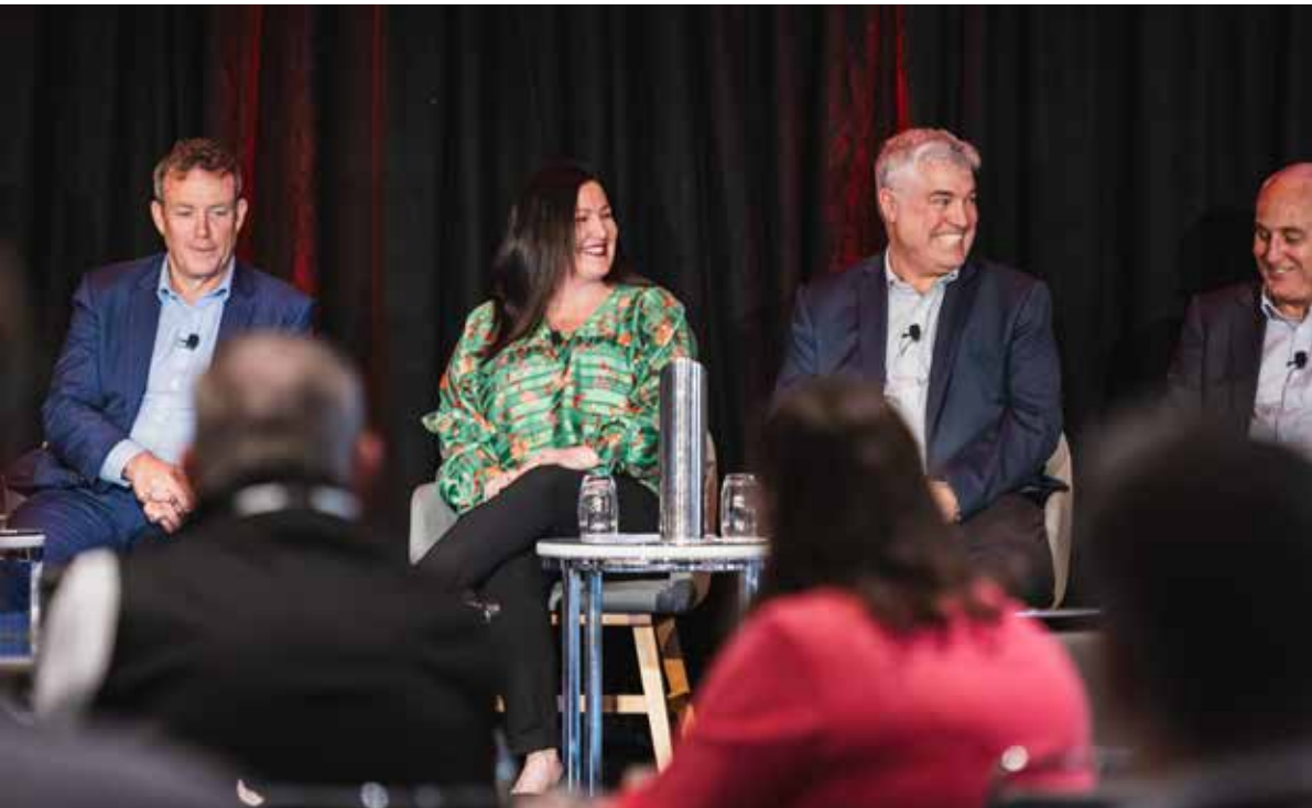
Panelists at NZ Rail Conference discussing level crossing safety