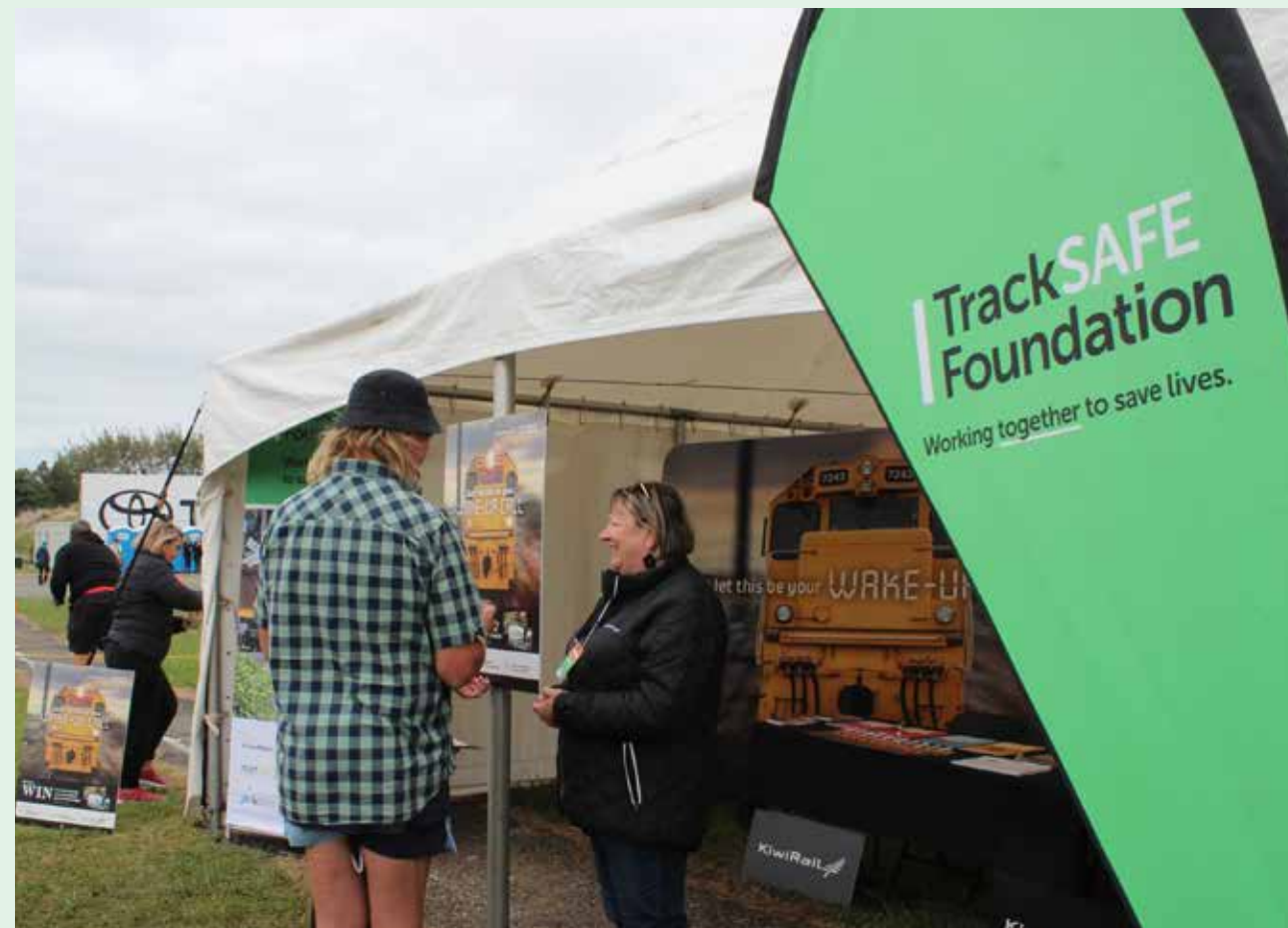
Rail safety engagement at the Central Districts Field Days

“Crossing railway tracks outside of level crossings is the leading cause of deaths on the railway network.”