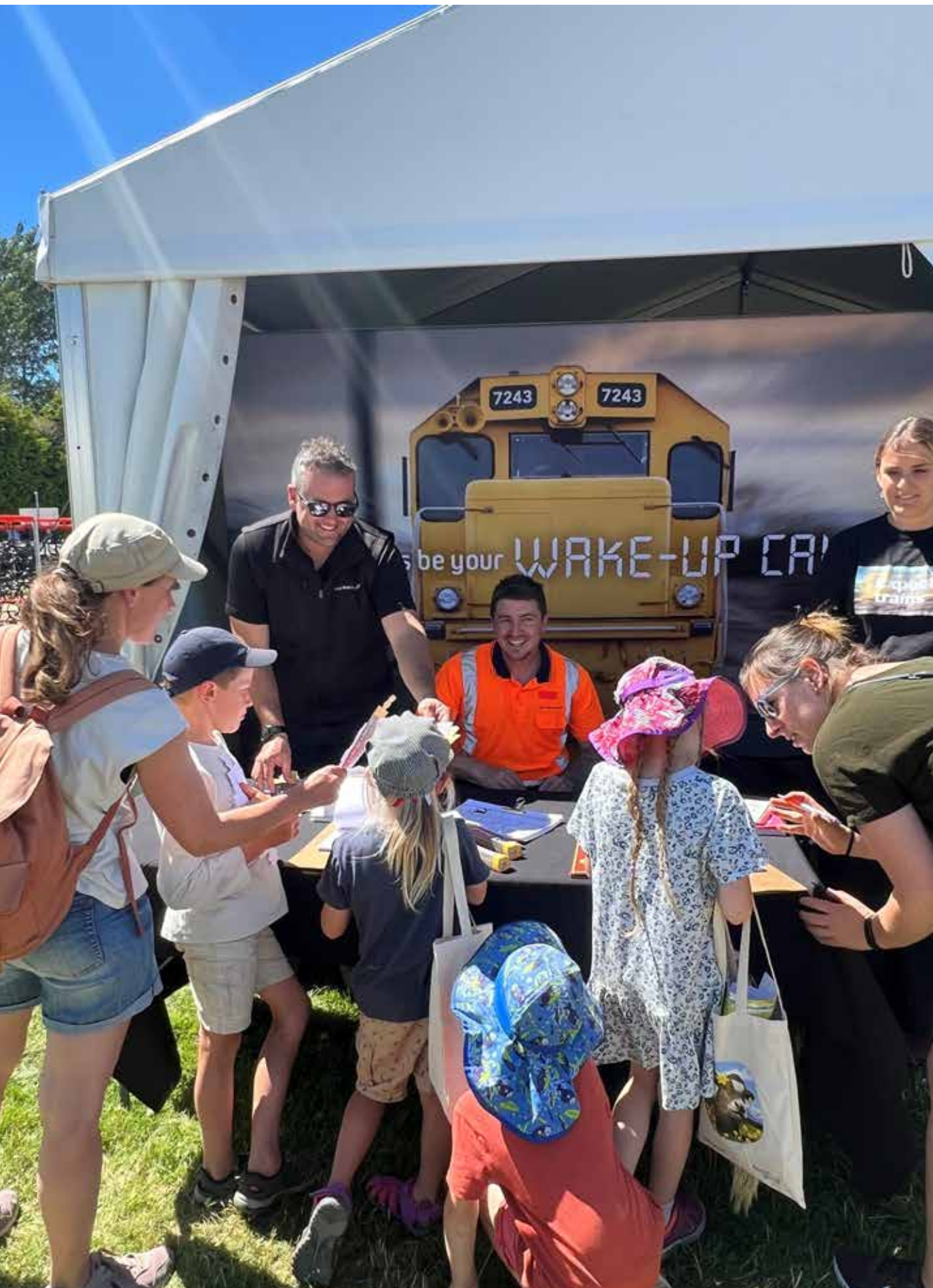
Rail safety education at the Southern Field Days in Southland